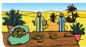
Using Your Talents