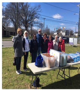
LWML Team handing out water and sack lunches near Cheatham Place public housing

In early March following tornado damage in Middle Tennessee, Our Savior LWML and church members prepared and delivered 100 sack lunches to public housing residents and first responders in North Nashville.