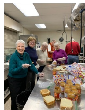
LWML Team preparing peanut butter sandwiches for sack lunches

We also delivered lunch supplies to Emmanuel Lutheran in Hermitage, TN, for 100 volunteers supporting Lutheran Church Charities as they worked to cut down trees and remove debris from the tornado damage.